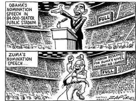
Zapiro as featured in the Mail & Guardian