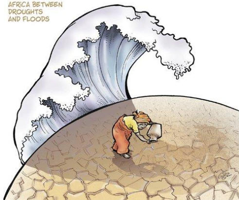
AFRICA BETWEEN DROUGHTS AND FLOODS

Financial Times: Ways to improve Africa's business culture, 21 Oct. 2010