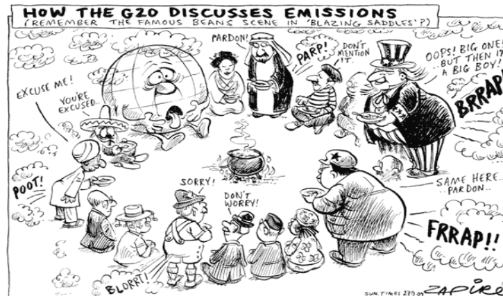
As Featured in Mail & Guardian , Oct 2009

Due to the devastating yearly drought endangering the lives of millions of people in Ethiopia , the country is calling for a review of the 1929 Nile agreement to be able to irrigate from the Blue Nile river to be able to support its hungry people and reduce its dependence on foreign food aid.