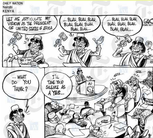
The Daily Nation, Kenya 5 February 2009

As industrialized countries are distracted by their own problems, the G20 London meeting in April provides the next opportunity to get attention and momentum. Is Africa ready?